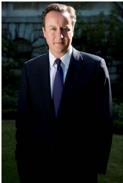
Prime Minister David Cameron

“The Internet Watch Foundation has again done an outstanding job in tackling images of child sexual abuse online.