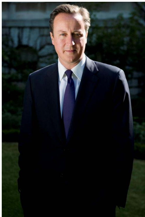
Prime Minister David Cameron

“The Internet Watch Foundation has again done an outstanding job in tackling images of child sexual abuse online.