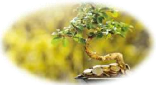
Assist in Equity Financing