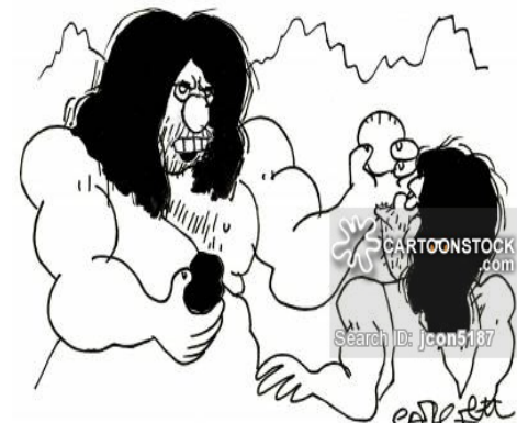
"Son, this is how we shave- take a clam shell, sharpen it with a rock..."