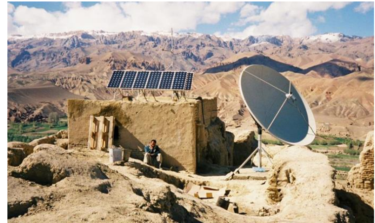
BBC FMs affected by interference

Most local administrations do not require registration