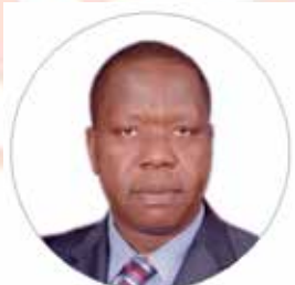
Dr Fred Okeng'o Matiang'i Cabinet Secretary Ministry of Information, Communications and Technology, Kenya